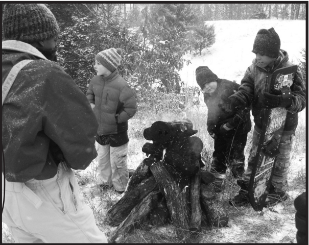
Some kids keeping warm by the fire on a recent snow-day from school. The snow-day turned into a wonderfully fun sled-day.